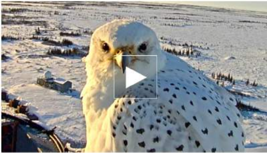
RAW: Rare white falcon caught on camera 0:20

On Tuesday, explore.org , a multimedia organization that documents nature around the globe, posted the video to Facebook. It shows the falcon yawning and subsequently looking straight into the camera. "It's almost like a photo bomb," den Haan said, laughing, adding the camera is set up through explore.org to capture the northern lights.