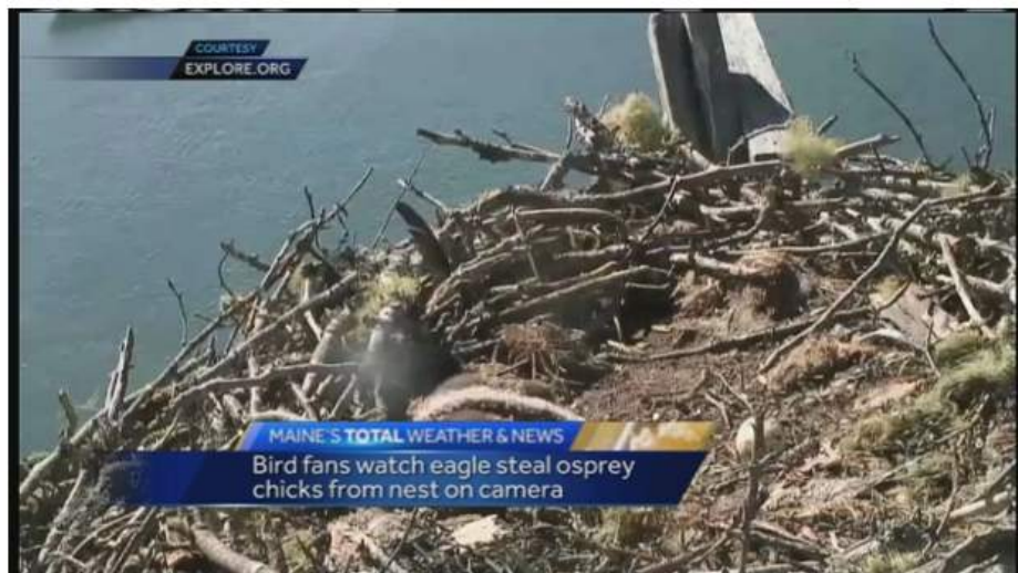
An Eagle was caught on camera stealing two osprey chicks from a nest. The camera was set up by Explore.org for people to monitor the nest.