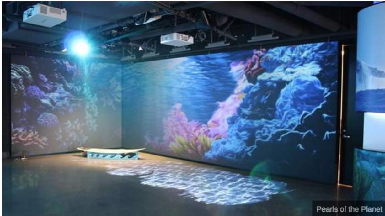
The Annenberg Space for Photography and Explore.org head into the ocean via a fresh exhibit.

True, the Pacific isn't all that far from Century City -- one suspects a lengthy brass tube could reach from Skylight Studios to the beach -- but the live cam experience goes further into the depths. Visitors will call upon the "colorful kelp beds of the Channel Island of Anacapa" as well as the waves of Hawaii and Alaska.