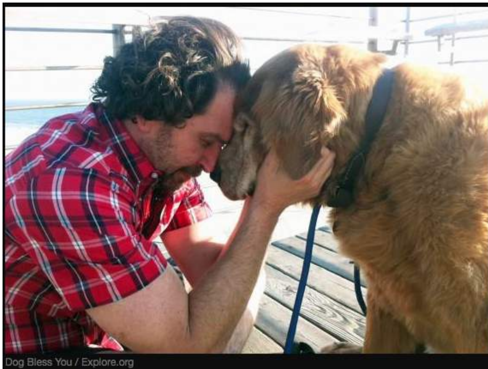
Dog Bless You / Explore.org