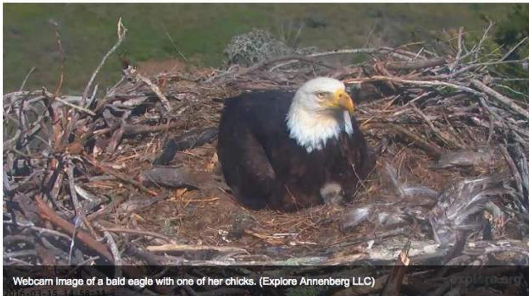
Webcam image of a bald eagle with one of her chicks.

Filed Under: Bald Eagle , Eagle Chicks , Hatched , Streaming , video