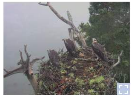
Hog Island, Maine, osprey chicks await their parents' return. Seconds later, an eagle makes off with one of the nestlings.

Three young chicks are calmly resting. Fans of the live cam know them as Eric, Little B, and Spirit. Both of their parents are momentarily away. The video shows how, in less than four seconds, a bald eagle swoops in. Little B takes flight (for the first time). Eric ducks and makes itself small. But Spirit is less fortunate as the eagle snatches it and flies away in a single motion. One osprey parent arrives on the heels of the marauding eagle but it's too late to prevent the attack. Eric and Little B survived.