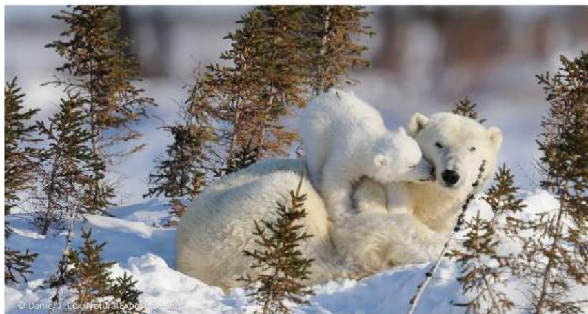
A mother and cub recently out of the den. Western Hudson Bay population in Manitoba, Canada. See more at Explore.org